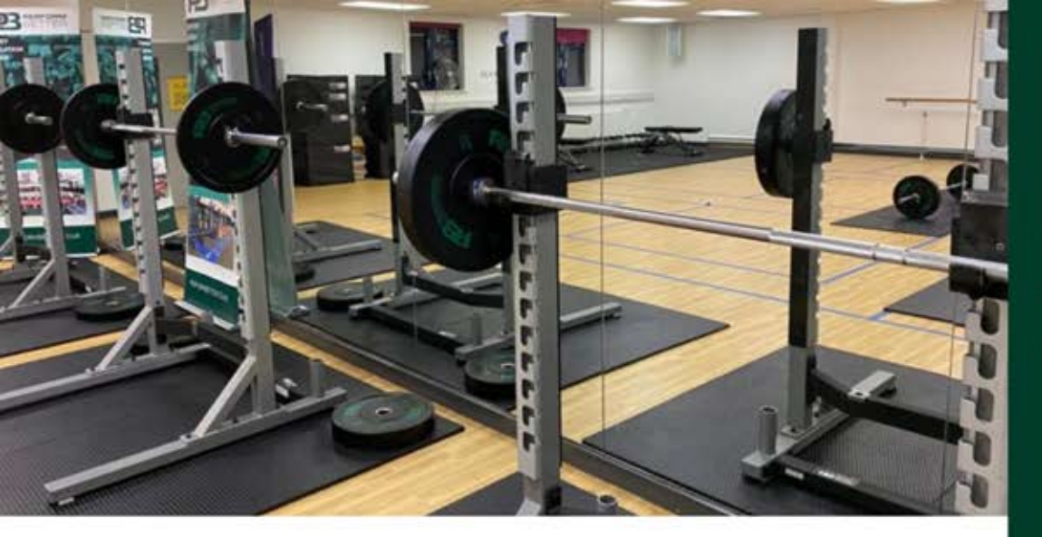
Perform Better were appointed to supply a Covid secure pop up gym for the England Netball Roses to train in the lead up to their January international series.

The equipment was installed at the Netball centre located at Loughborough University, with the layout and design created by the Perform Better experts.